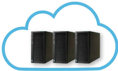
RISCO Cloud Server